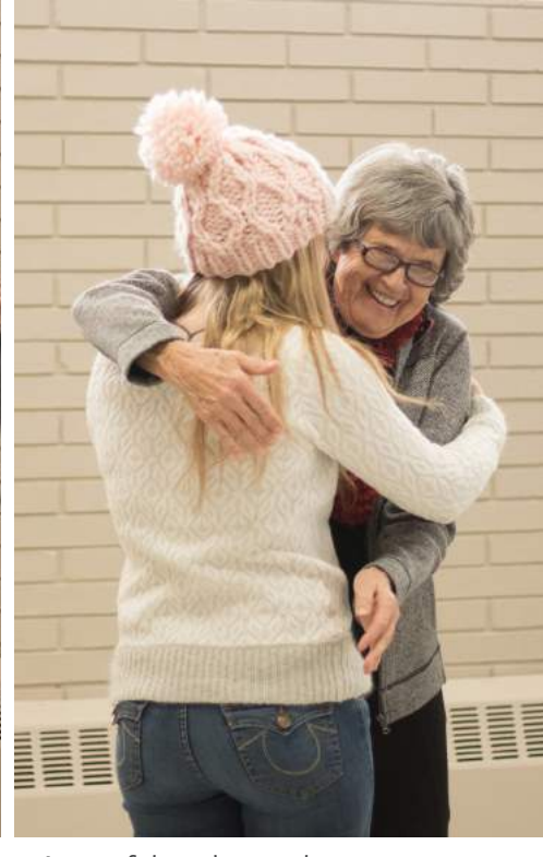
▲ A grateful student embraces her donor after a scholarship awards ceremony